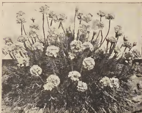
Armeria Lauchiana Best Dwarf Variety